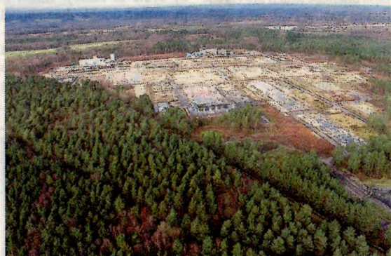
St Edward Homes' has plans for a new town at the former Pyestock site.

"For that reason I will not present a plan until I can be satisfied that the evidence supporting it will stand up to examination."